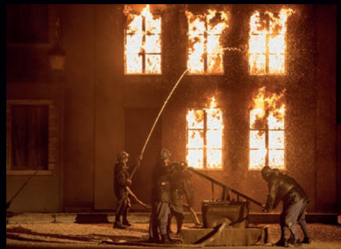
Verdun engulfed in Flames

22, 28, 29 June 5, 6, 12, 13, 19, 20, 26, 27 July 2024