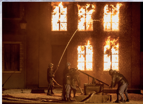
Verdun engulfed in flames

60 scenes will retrace before your eyes the crossed destiny of soldiers and civilians, French and German, from the Belle Époque to the First World War; from the battle of Verdun to the Armistice; from 1927 to the present day.